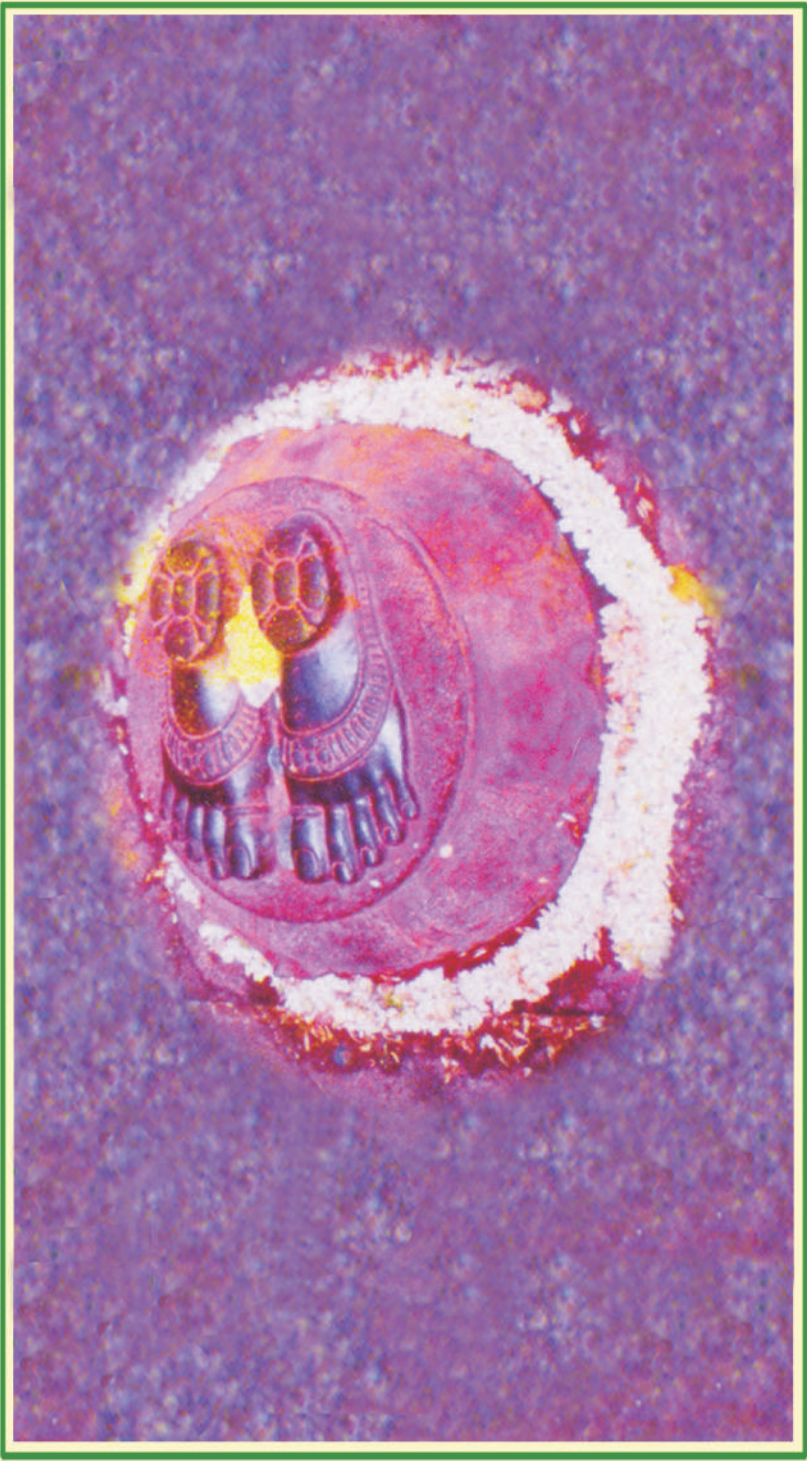
Divine Feet of Lord Sri Venkateswara - Narayanagiri